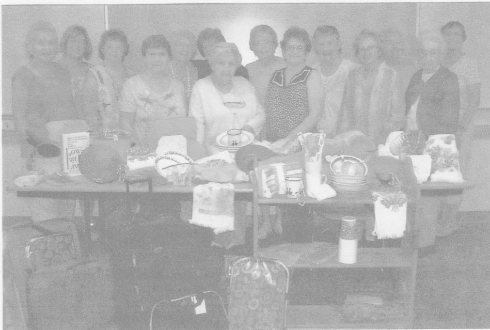
Picture of Eaton County FCE Members displaying some of the items collected for their 2015 charity.